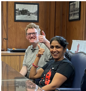
Link-Up Full Day Program