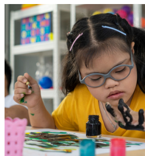
Light-Up Kids Programs