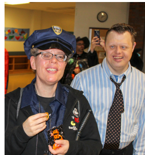
Lift-Up Programs for Group Home Residents