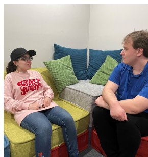
Level-Up Evening & Weekend Programs